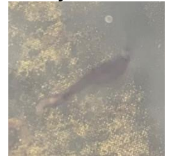
Unidentified object in the dipping area!

As Red kites are being saved from extinction and reintroduced in England they have been spotted over Heyswood at least once - look out when you're next there. They have a distinctive wide feathered wing, forked tail and colour markings. Due to less visitors during the pandemic, there have also been more sightings of deer - large and small but all too quick to catch on camera! Our wildlife pond is also becoming more established with pond dipping equipment now available for investigating.