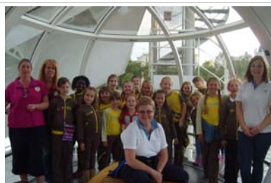
3rd West Barnes Brownies went on the London Eye as part of their Adventure 100 - Big wheels